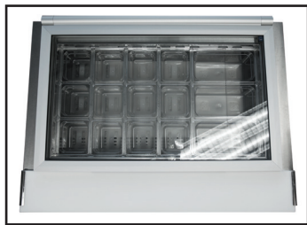
Glass Lid Top

This product is equipped with a fine mesh filter to the front of the condenser to catch dust, and a rotating brush that moves up and down daily to remove excess buildup outward and away.